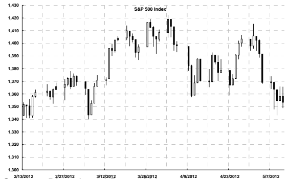
U.S. S&P 500 Index – 3-Month Chart