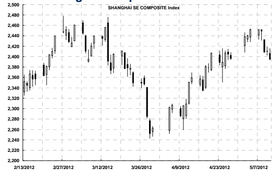
Shanghai Composite – 3-Month Chart