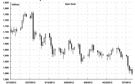
Spot Gold – 3-Month Chart

Source: Bloomberg LP, as of May 11, 2012