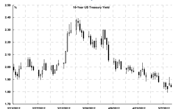
10 Years U.S. Treasury Yield – 3-Month Chart

Source: Bloomberg LP, as of May 11, 2012