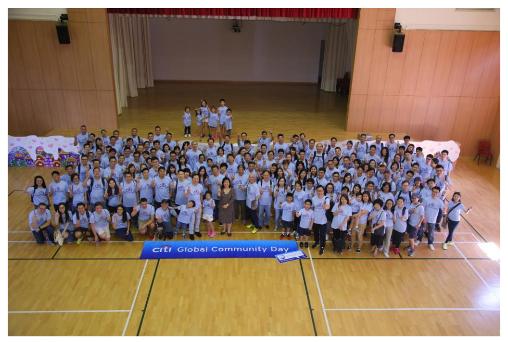
In Hong Kong, over 3,000 volunteers participated in 29 community activities in this year's Citi Global Community Day.