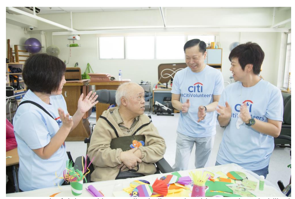
Citi volunteers spent joyful time with mentally challenged residents at the rehabilitation centre.