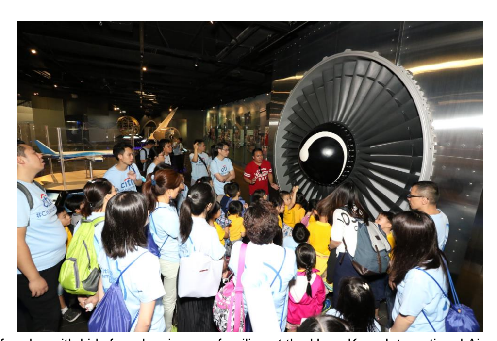
A fun day with kids from low-income families at the Hong Kong International Airport.