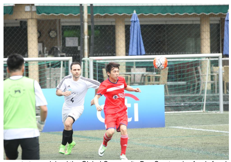
16 corporate teams joined the Global Community Day Cup to raise funds for charity.